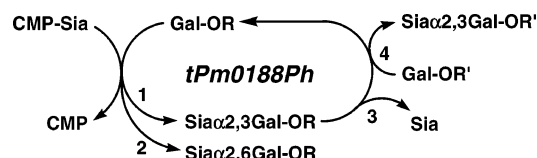
Figure 1. Multiple functions of a Pm sialyltransferase (tPm0188Ph).

The recombinant tPm0188Ph was a multifunctional enzyme for which four types of functions (Figure 1) have been identified. It